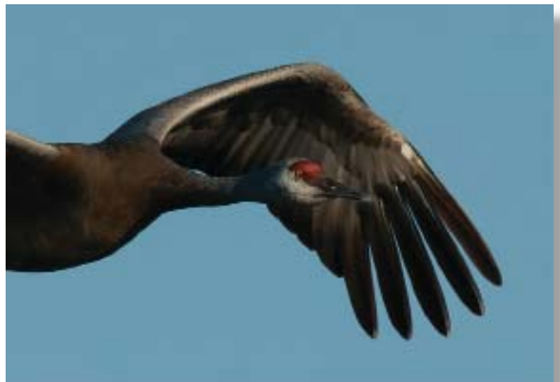
Lesser Sandhill Crane Fly-By Jeff Hobbs