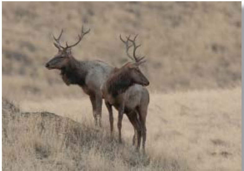
Tule Elk, San Luis Reservoir