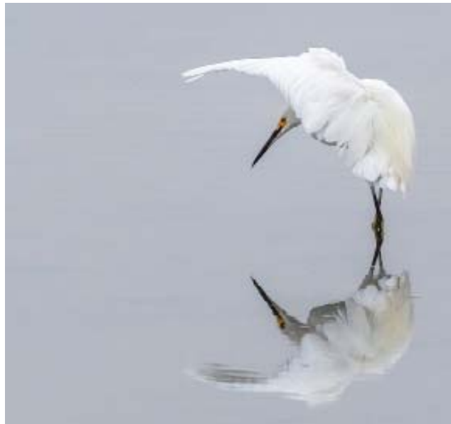
Snowy Egret fishing with reflection